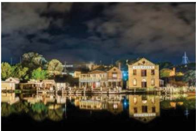
Flagstaff Hill Maritime Village