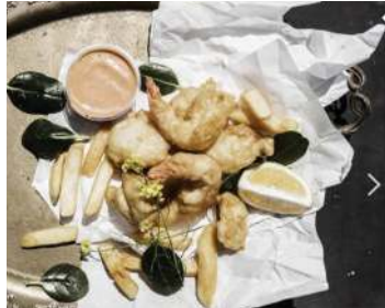
TASTES OF THE GREAT OCEAN ROAD FOOD GLORIOUS FOOD! Everyone has to eat. Some of us are more selective than others so we thought we'd give you some inspiration with a selection of our favourite dining experiences on the Great Ocean Road